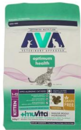
Ava Kitten Chicken 2kg