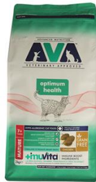
Ava Mature Chicken 7+ 4kg