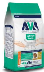
Ava Adult Chicken 2kg